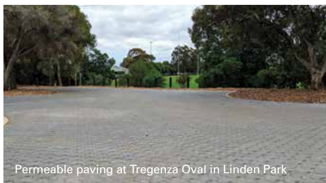
Permeable paving at Tregenza Oval in Linden Park

Find out more! Explore the Water Smart Burnside website at: burnside.sa.gov.au/water-smart