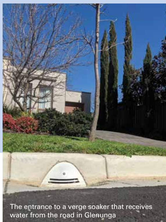
The entrance to a verge soaker that receives water from the road in Glenunga

The tanks are like big plastic crates designed to capture water and allow it to soak into the surrounding soil. These tanks are typically 150 L and wrapped in geofabric, a material that allows water out but stops soil getting in. Because they are used to increase the volume of water soaking into Council verges, these devices are called verge soakers. Some verge soakers receive water from the road and others receive water that is collected on the roofs of nearby houses.