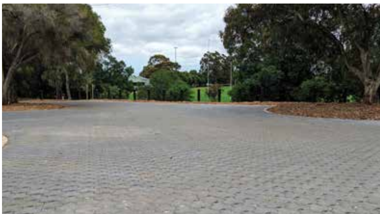
Permeable paving at Tregenza Oval in Linden Park

The tanks are like big plastic crates designed to capture water and allow it to soak into the surrounding soil. These tanks are typically 150 L and wrapped in geofabric, a material that allows water out but stops soil getting in. Because they are used to increase the volume of water soaking into Council verges, these devices are called verge soakers . Some verge soakers receive water from the road and others receive water that is collected on the roofs of nearby houses.