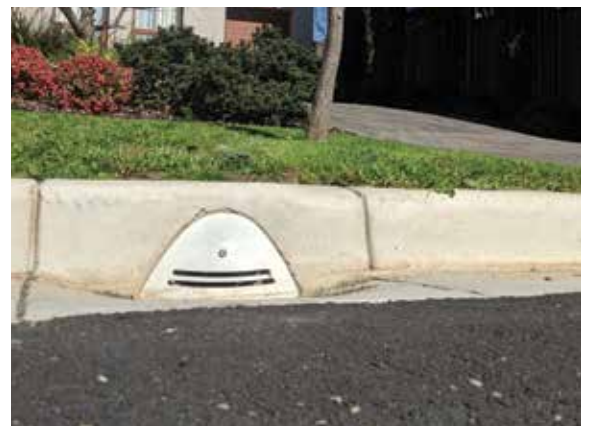
The entrance to a verge soaker that receives water from the road in Glenunga