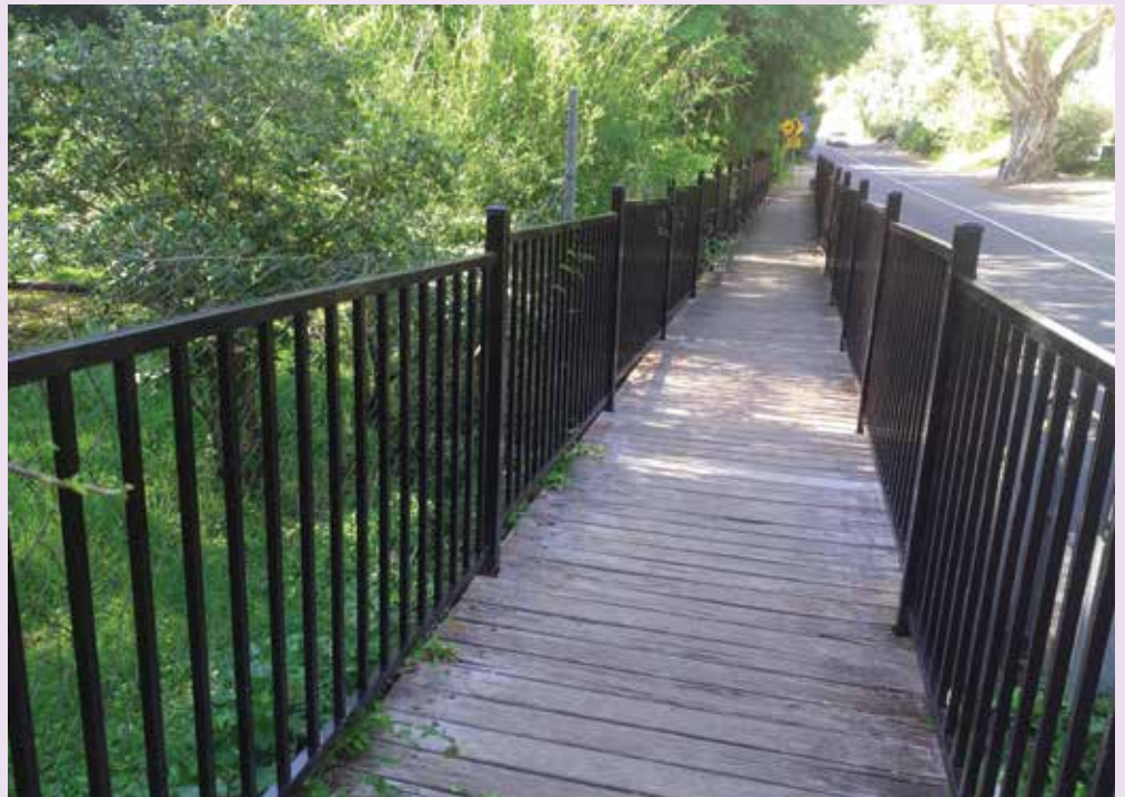
The new bridge fence on Waterfall Gully Road.

Kingsley Avenue Reserve fencing and retaining works ($20k).