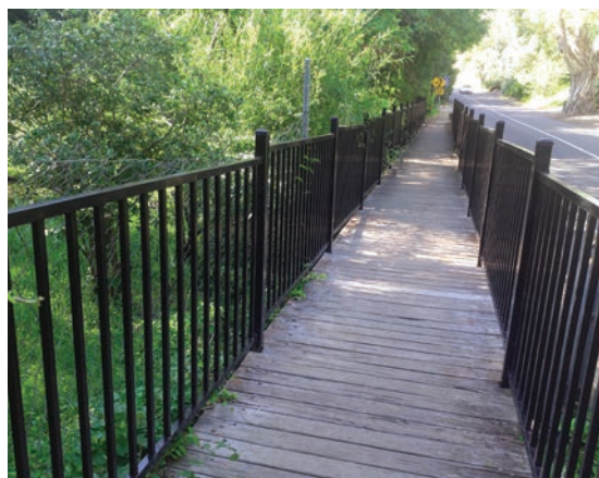
The new bridge fence on Waterfall Gully Road.

Kingsley Avenue Reserve fencing and retaining works ($20k).