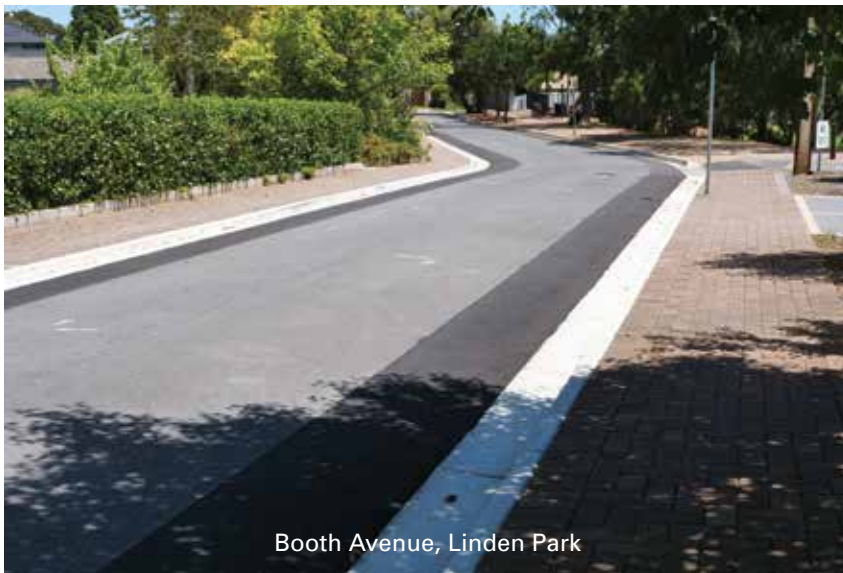
Booth Avenue, Linden Park