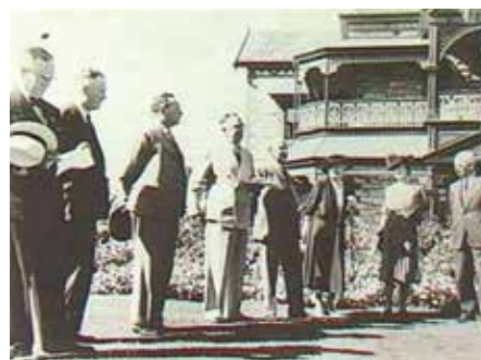
Official party at 'Attunga' to inspect the gift of Otto von Rieben to the City of Burnside.