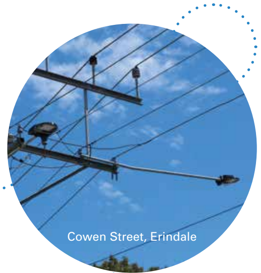
Cowan Street, Erindale