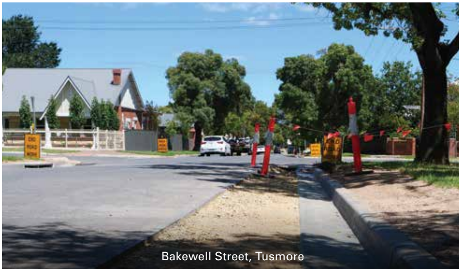
Bakewell Street, Tusmore

Thomas Place (Alexandra Avenue to Grant Avenue), Rose Park