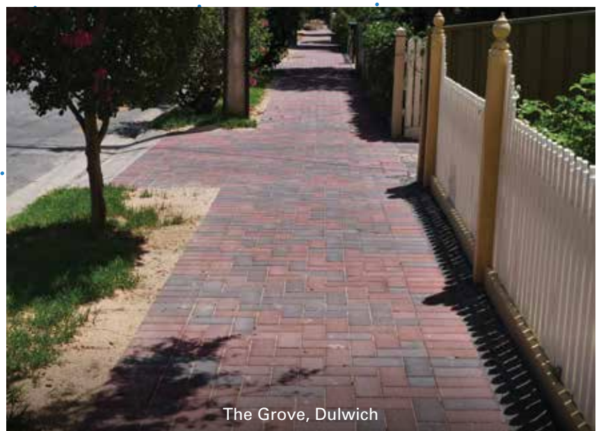
The Grove, Dulwich