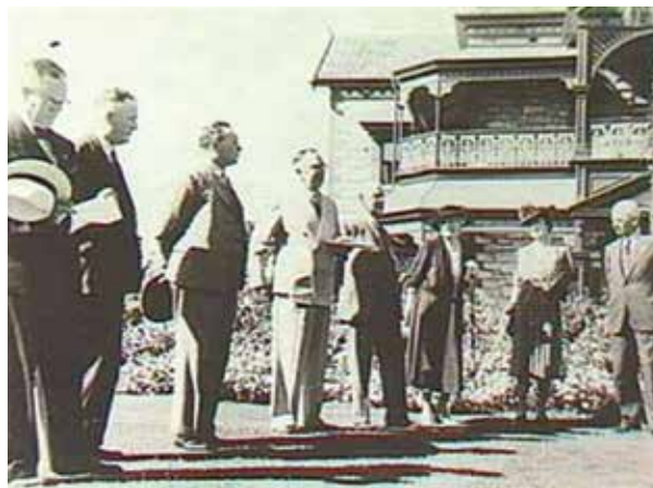
Official party at 'Attunga' to inspect the gift of Otto von Rieben to the City of Burnside.