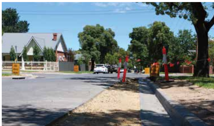
Bakewell Street, Tusmore

Thomas Place (Alexandra Avenue to Grant Avenue), Rose Park