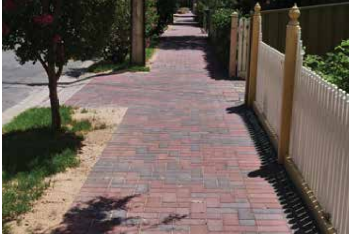
The Grove, Dulwich