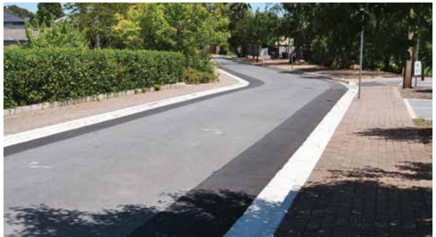
Booth Avenue, Linden Park