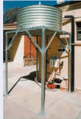
Unley City Council. Unley Museum