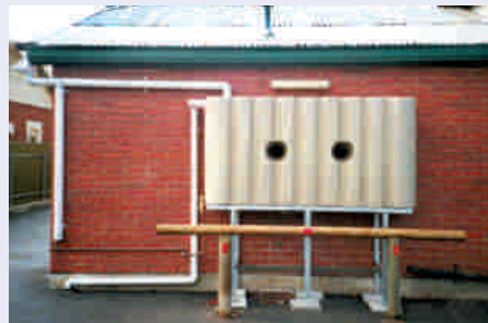
City of West Torrens. Eco House