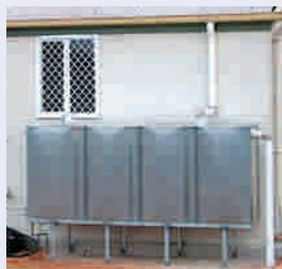
Whyalla City Council. WERIC House