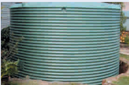
Campbellton City Council. Residence