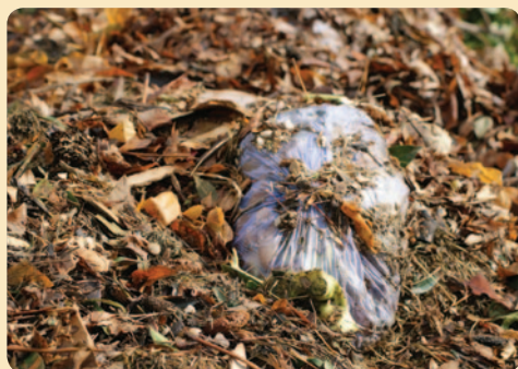
An excellent example of a compostable bag containing food scraps for composting.