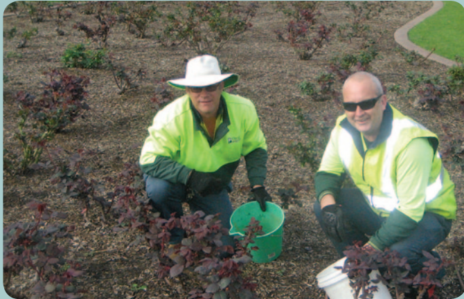
Parks and Gardens staff attending to the Rose Gardens at Fergusson Square, Toorak Gardens.