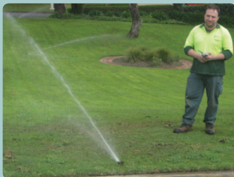
Irrigation audits at Waterfall Terrace Reserve, Burnside.

Irrigation audits are important to make sure that all Council reserve watering systems are operating efficiently before the irrigation is turned on for our spring and summer watering programs.