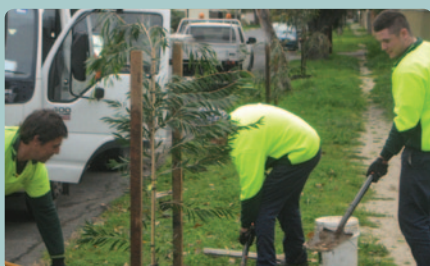
Council's Arboriculture team members planting the last trees of Council's interplant program.