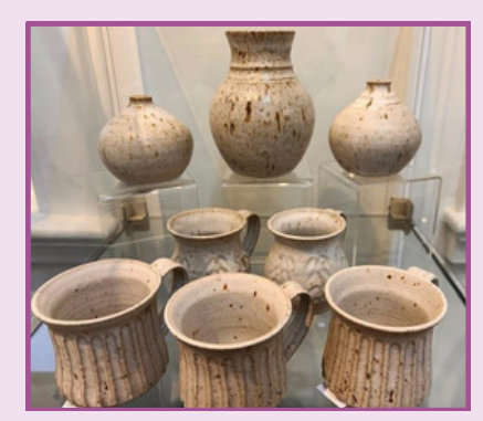
Rosalyn Sachsse, Ceramics