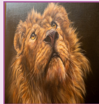
Elise Leslie-Allen, King , oil

Accepting 2D and 3D artwork created around the theme of 'wildlife'. Artists are encouraged to let their creativity soar. This theme may suggest non-domestic fauna and flora, the use of wild materials, the interpretation of personality or environment.