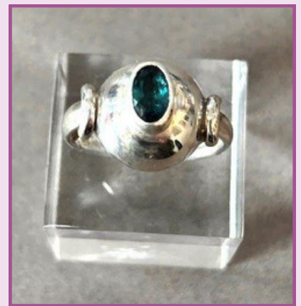
Diane Southwell, Topaz Hollow Ring