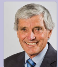
David Parkin Mayor

Representations made by South Australian Councils on behalf of those affected by this decision have been unsuccessful. I encourage concerned citizens to express their view to their State and Federal Members of Parliament (including Members of the Legislative Council where the opportunity exists to influence legislation on this matter) and press for a favourable resolution to the issue.