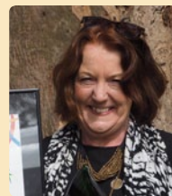
Newland Park Kindergarten – Community Art Project

The main fence of the kindergarten was displayed with wonderful exhibitions of crafts, such as knitted, crocheted, tomboy stitched creations, drawing much attention from the community.